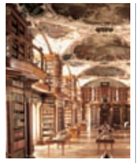
Museums, art galleries

The HygroPalm2-series (with integrated or interchangeable probes) is ideal for all applications where exact measurement of humidity and temperature is of decisive importance, e.g. the food and pharmaceutical industries, printing and paper industries, many trades, the sciences, meteorology, agricultural sector, climatology, etc. There is hardly a field today in which these parameters may be ignored. It is ultimately the measuring task at hand that defines the HygroPalm instrument that best meets your needs.