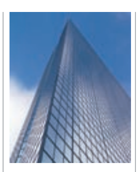
HVAC / Building management