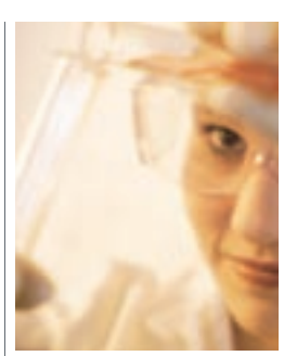
Healthcare, the sciences